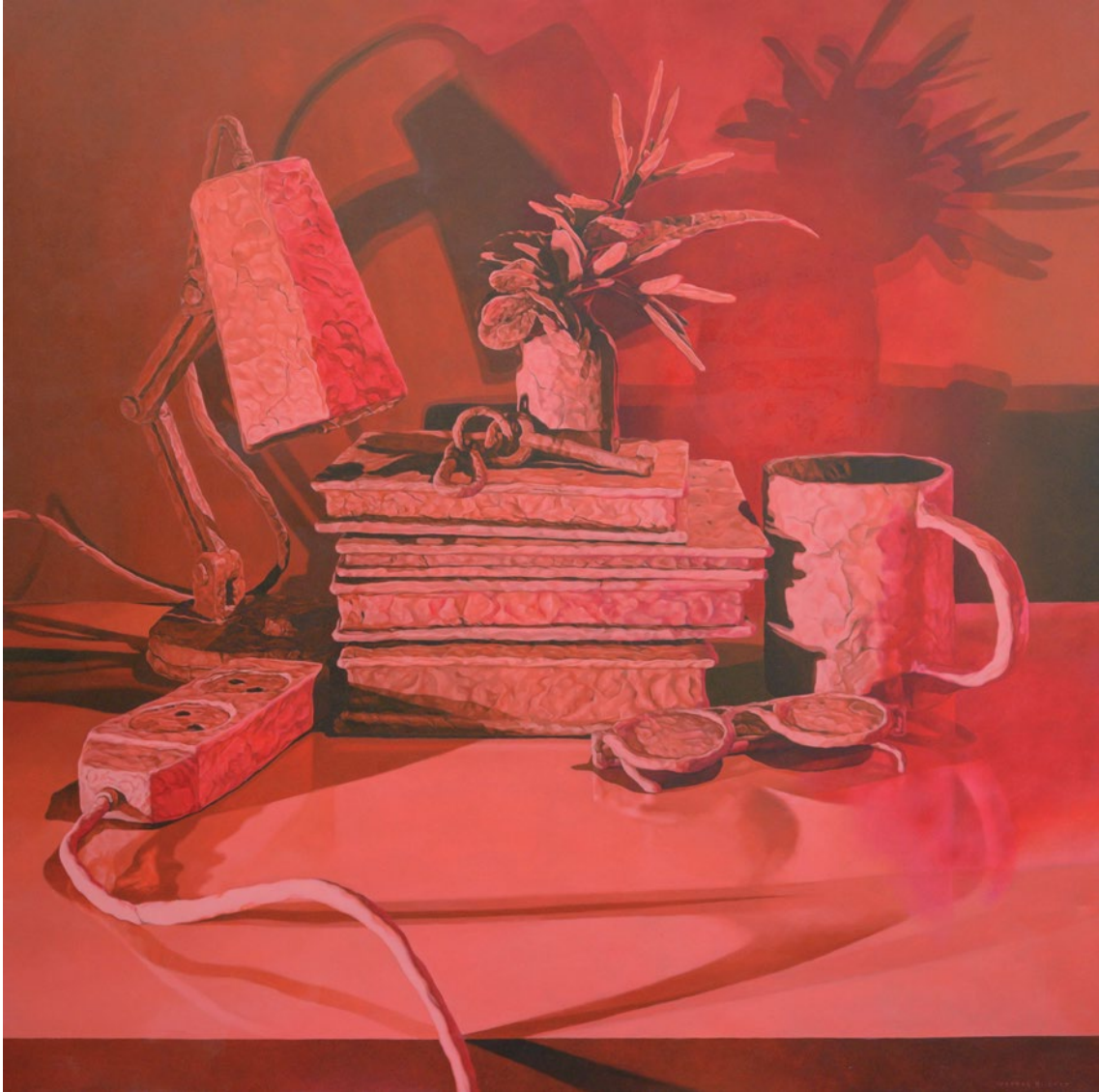
Recess , 2025 oil on canvas 150 x 150 cm