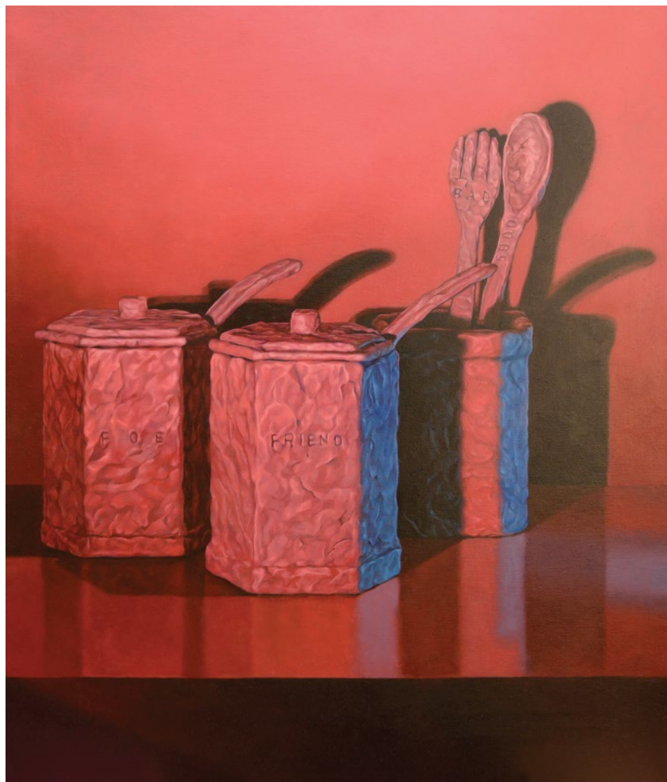
Versus #2, 2025 oil on canvas 60 x 50 cm