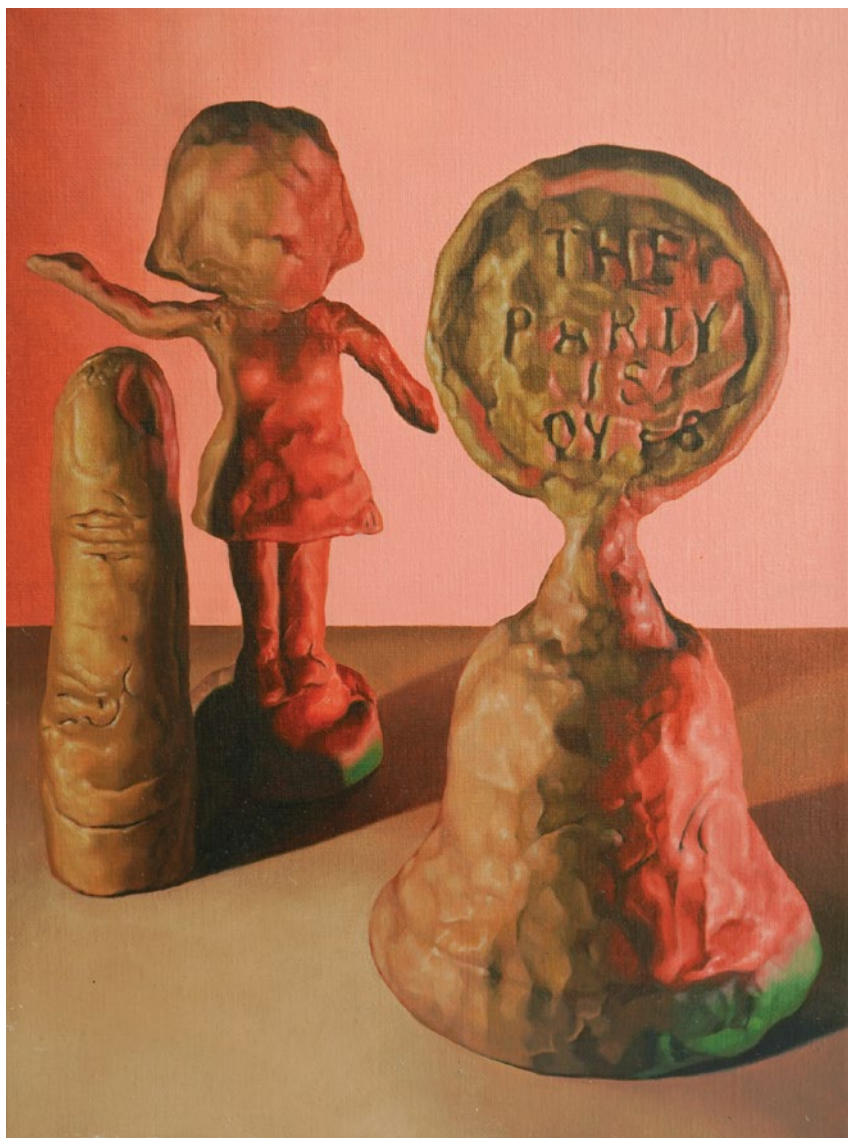
The Party's Over , 2024 oil on canvas 40 x 30 cm