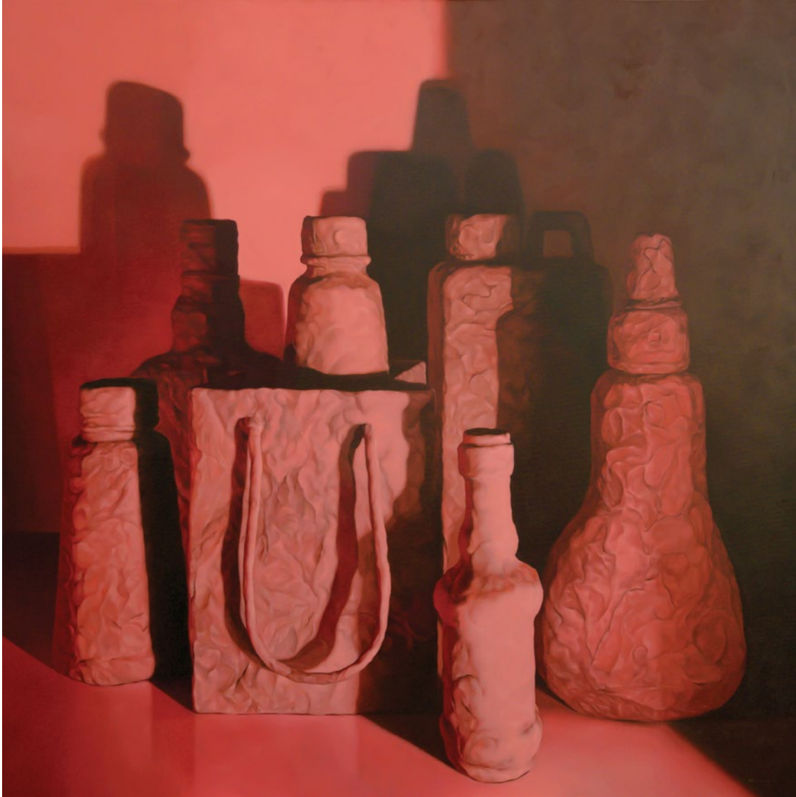
Hollow Inside , 2025 oil on canvas 150 x 150 cm