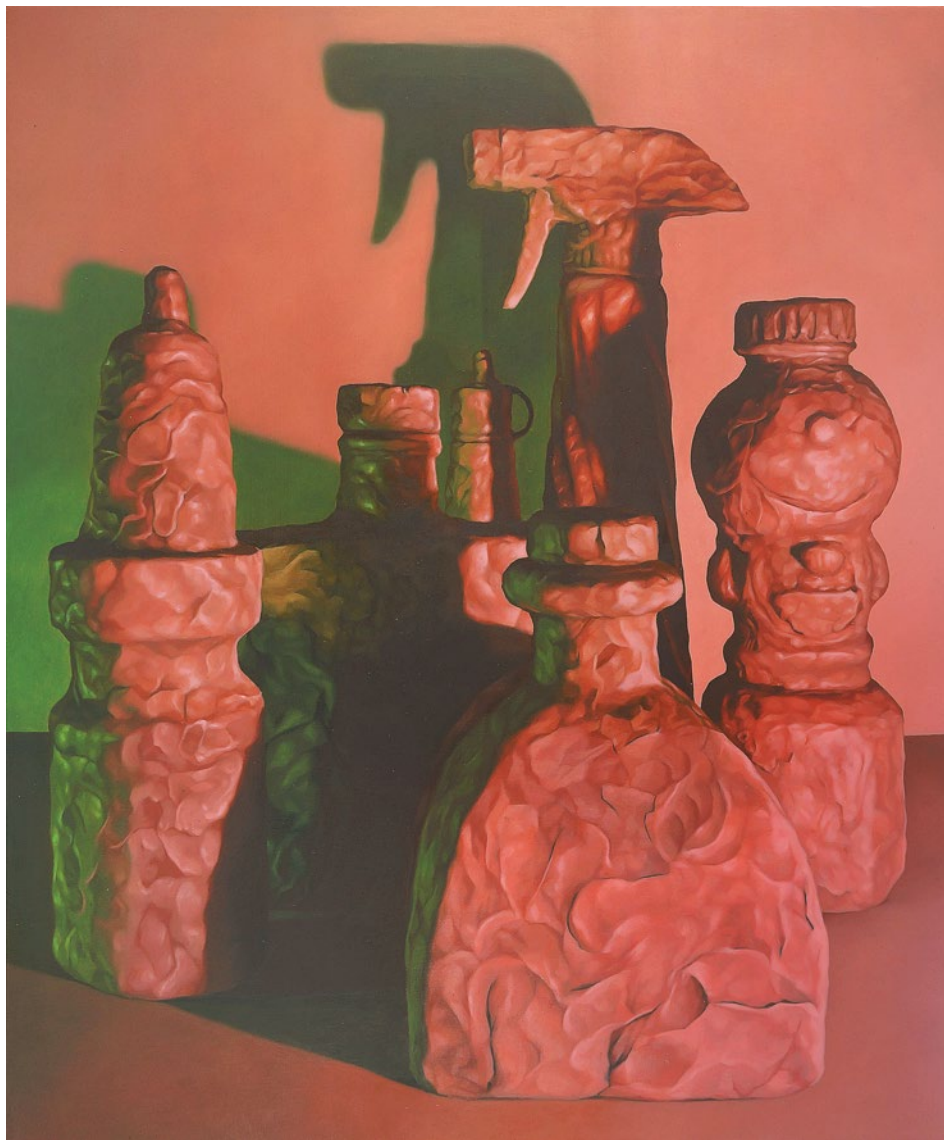
Containers #2 , 2024 oil on canvas 60 x 50 cm