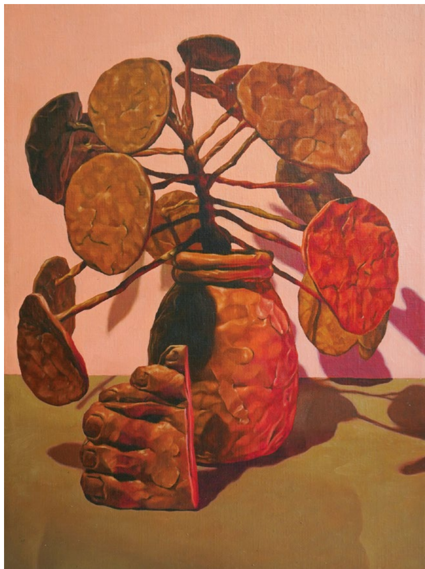
Pale Pilea , 2024 oil on canvas 40 x 30 cm