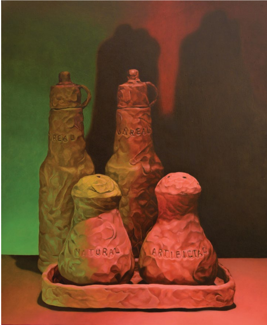
Versus #1 , 2025 oil on canvas 60 x 50 cm