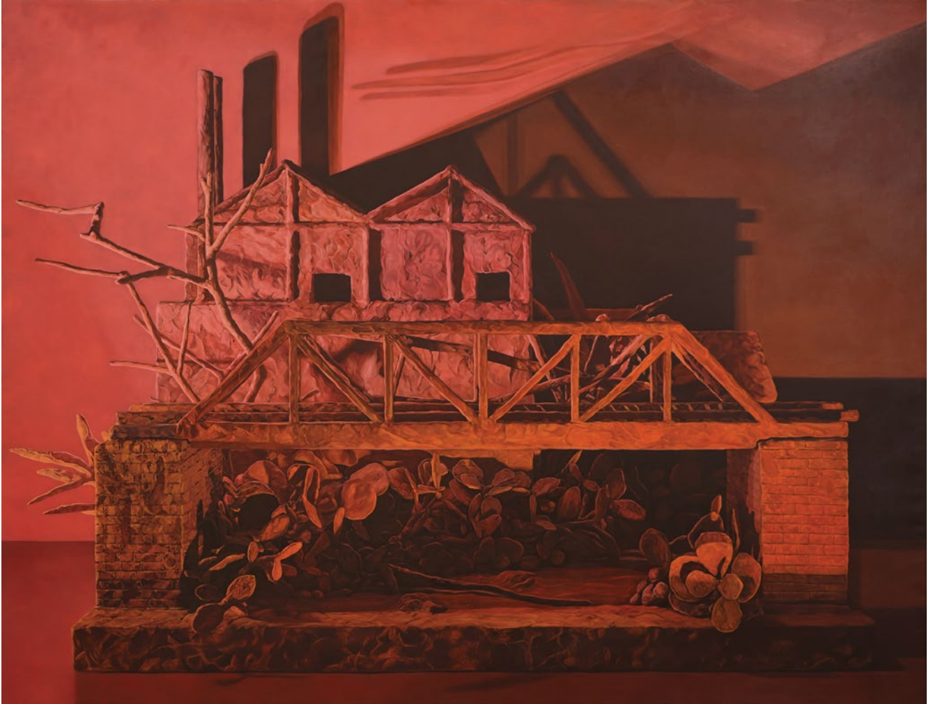
The Light that Remains, 2025 oil on canvas 150 x 200 cm