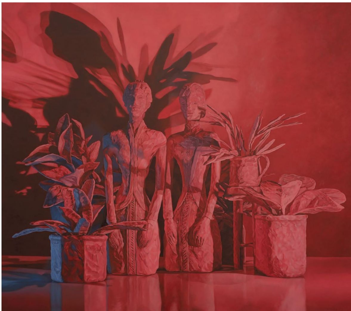
Loro Blonyo , 2025 oil on canvas 150 x 170 cm