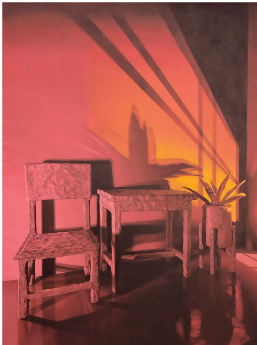
Amber Grid, 2025 oil on canvas 120 x 90 cm